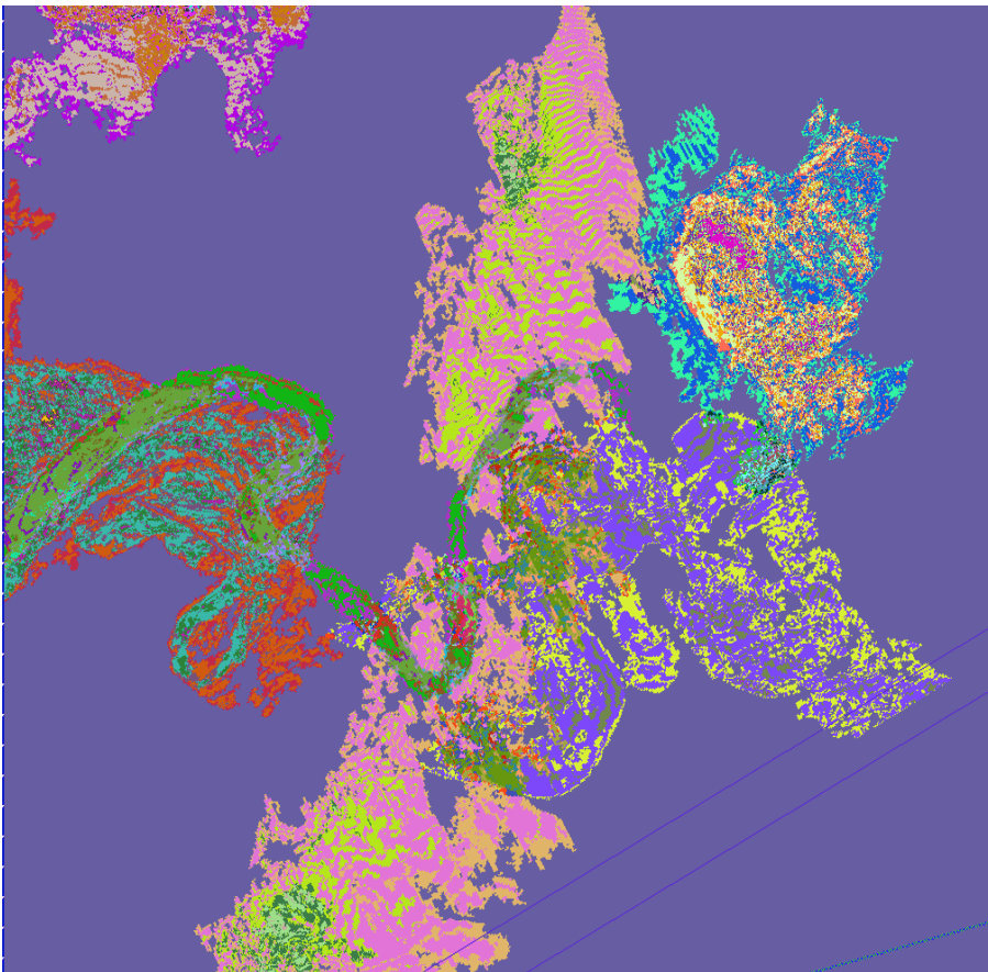
Figure 2. Turbidite channel interpretations that were made with automatic detection algorithms.

An example of application is illustrated with a South African data set in a turbidite sequence. Here many stratigraphic bodies were easily isolated utilizing automatic volume detection techniques. An illustration of some different isolated features is shown in the figure 2. Separate stratigraphic bodies are analyzed by the software and colored differently to better visualize the results.