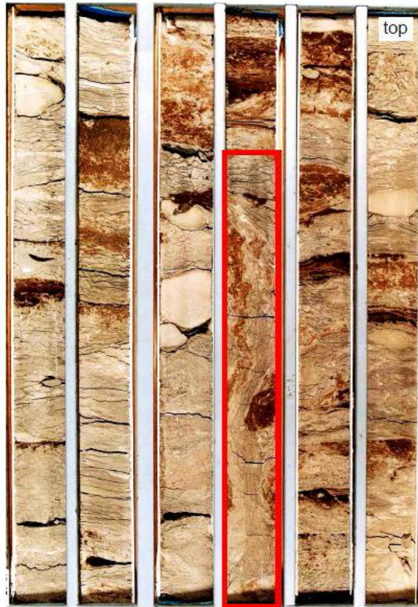
Figure 3. Vertical fluidized mud-dominated ribbons (frame) have sinuous to contorted color banded fabrics. The central mud streak passes outward to parallel layers of silt and very fine sand. Each core box slat is 75 cm long.