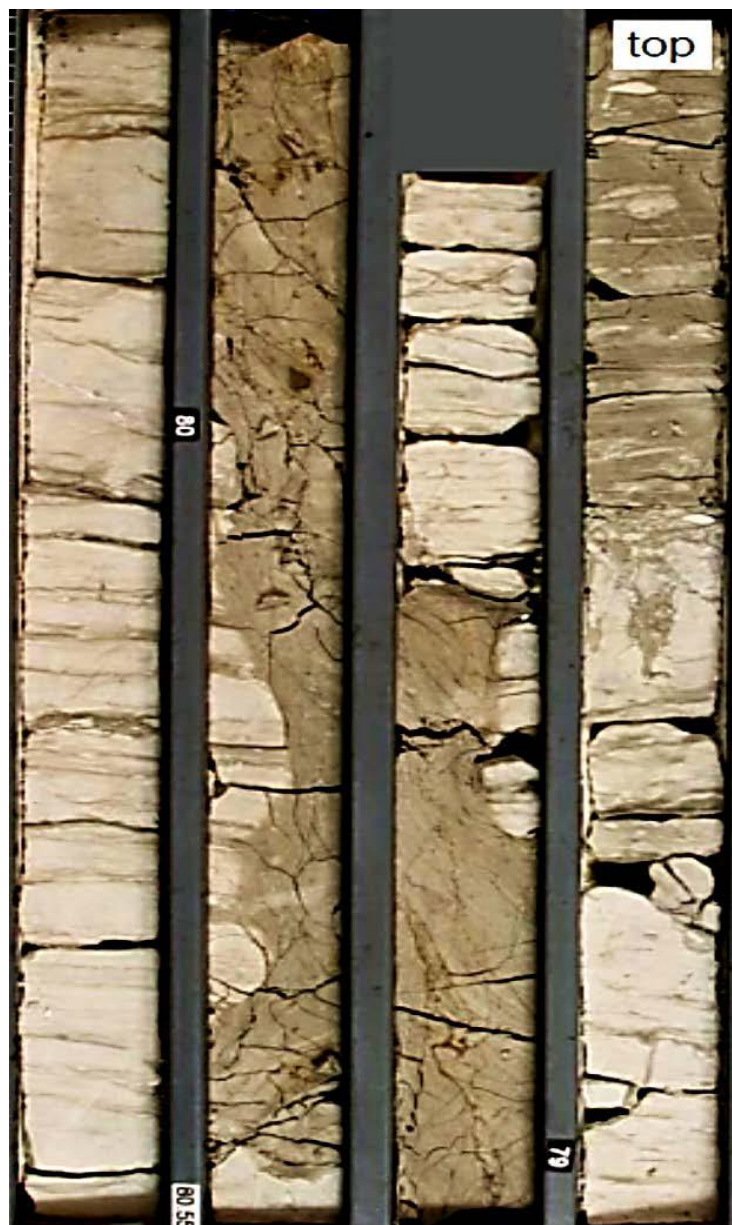
Figure 1. Hydroplastic mud flow along a dike that cross-cut Firebag Member strata of the Waterways Formation (Upper Devonian). Ascending karst aquifer flows disintegrated wall rocks and sourced the upwardly mobilized hydroplastic slurries along the expanded dike conduits. Prominent upward fluidization flow lines developed as the slurry viscosity increased. Each core box slat is 75 cm long.