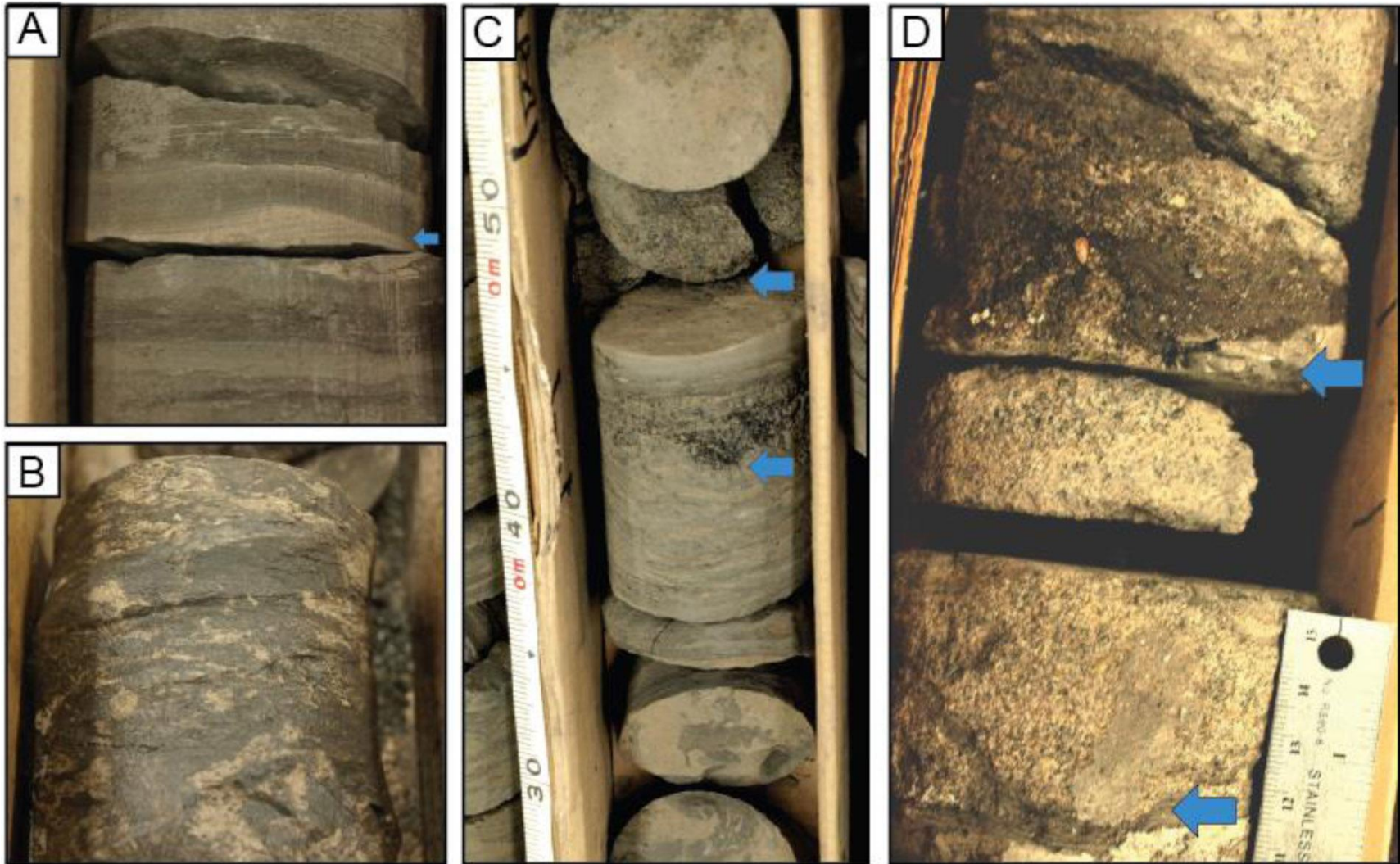
Figure 1. (A) Facies 1 contains current rippled (arrow) event beds with minimal bioturbation. (B) Facies 2 is composed of thoroughly bioturbated sandstones with a bioturbation index of 4-6. Burrows are typically Cruziana ichnofacies and often include Helminthopsis , Paleophycus , Planolites , Chondrites , Phycosiphon , Thalassinoides , Fugichnia , Scolicia , and Teichichnus . Coarse-grained cherty sands are often found at the base of event deposits (C). Multiple event beds are commonly separated by muds- see arrows in (C) and (D).