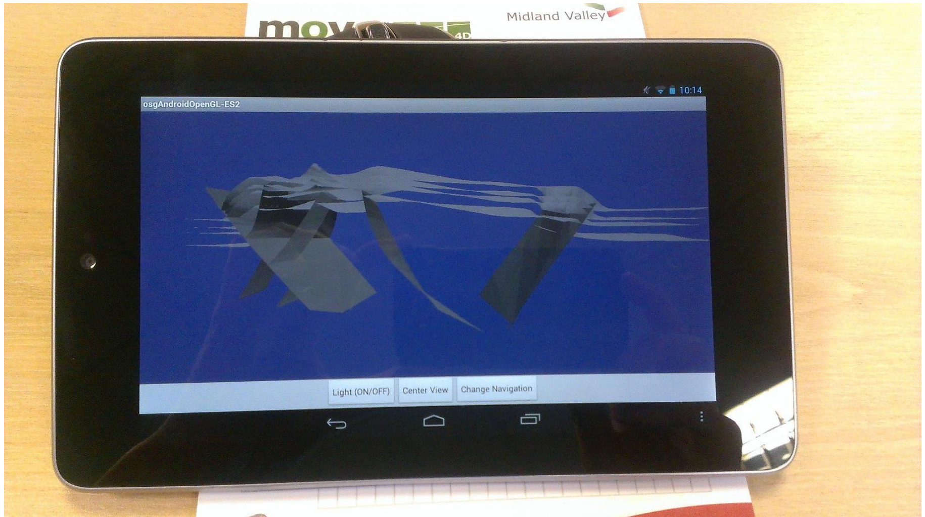
Figure 2. FieldMove™ featuring 3D visualization on a Google Nexus 10 tablet.