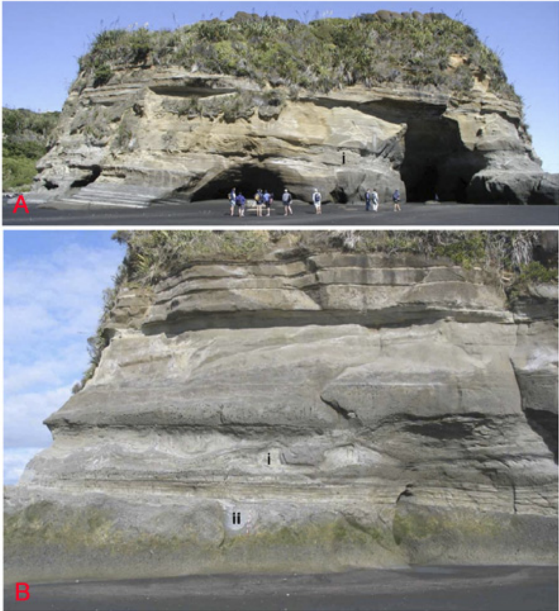
Figure 5A. Type 3 MTC exposed in the middle portion of the photo, Patangata Island, Tongaporutu (labeled i). The bed labeled (i) comprises a 2-m-thick slumped interval stratigraphically bounded by thick-bedded basin-floor fan sandstones, Mount Messenger Formation. Figure 5B. Detail of Type 3 MTC bed (i) at Patangata Island, Tongaporutu. The bed displays fluidized load structures and water escape features and overlies another more sand-rich MTC bed (ii) at the base of the outcrop. Scale bar in center of photo near (ii) is 1 m long.