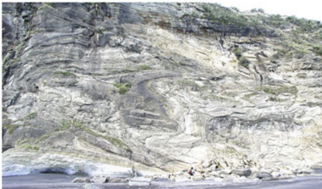
Figure 2. Type 1 MTC successions, north of Awakino, Mount Messenger equivalent (person for scale). Upper photo: Broad-scale folding; Middle photo: Recumbent folds and shear surfaces; Lower photo: Co-planar fold axes.