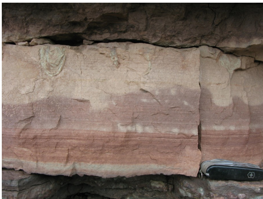
Figure 2: Weakly bioturbated sandstone with parallel lamination and Diplocraterion ichnofossil at upper left.