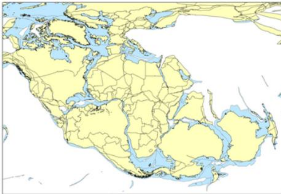
Figure 2: Getech global plate tectonic model