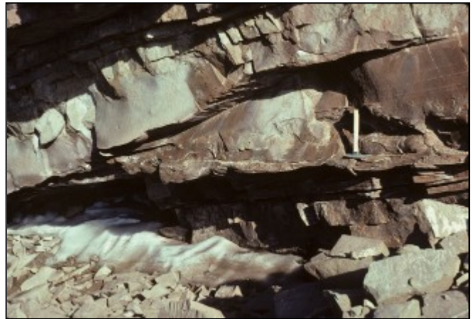
Figure 3 (left): Red sandstones of Canyon Fiord Formation passing vertically into grey carbonated-dominated shelf cycles of Belcher Channel Formation, east Blind Fiord, southwest Ellesmere Island