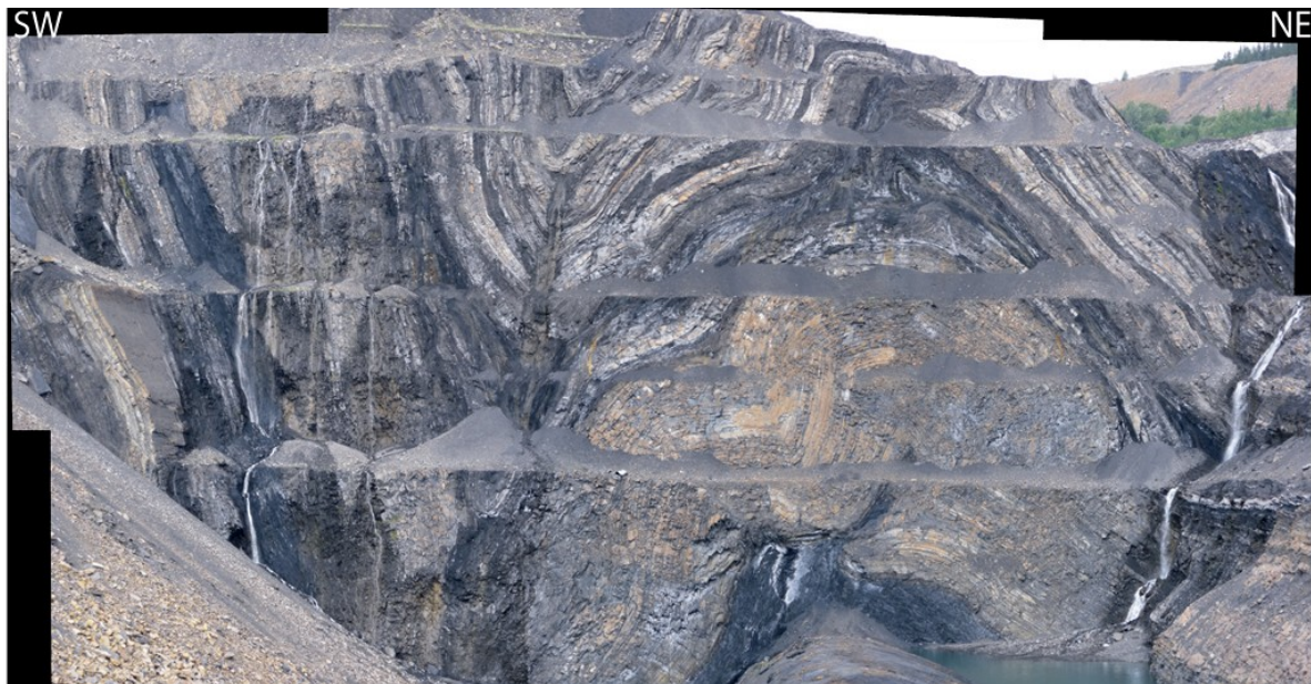
Figure 2: Photograph looking down the fold axis of a secondary fold on the forelimb of the MacEvoy Anticline.