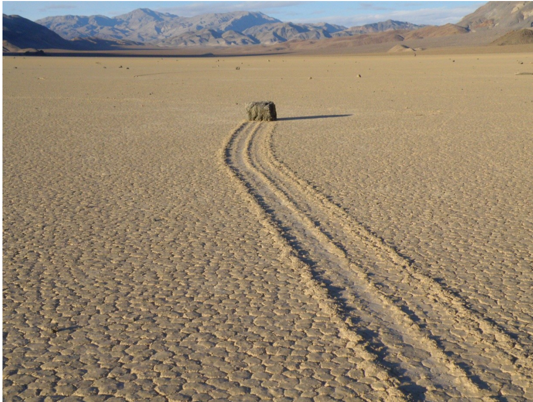
Figure 1: One of the many sliding rocks on Racetrack Playa, Death Valley National Park, in the winter of 2009. The rock is approximately 25cm across.