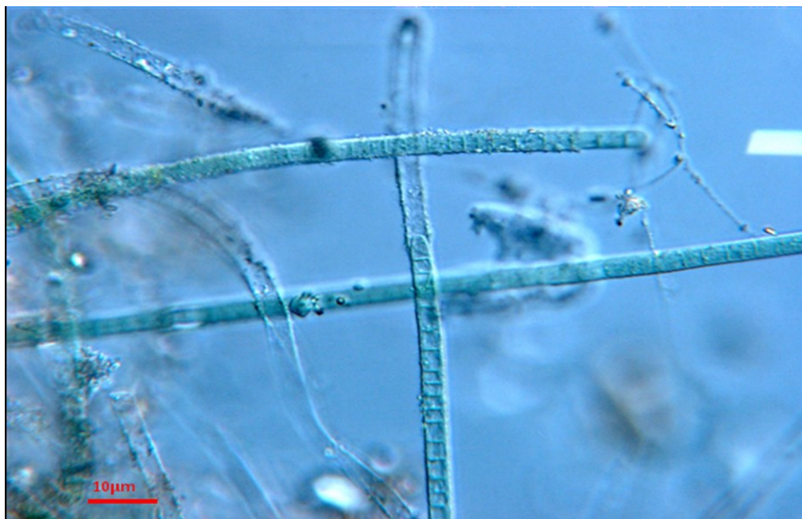
Figure 3: Elongate, narrow and segmented nature of Microcoleus , microscopic view.