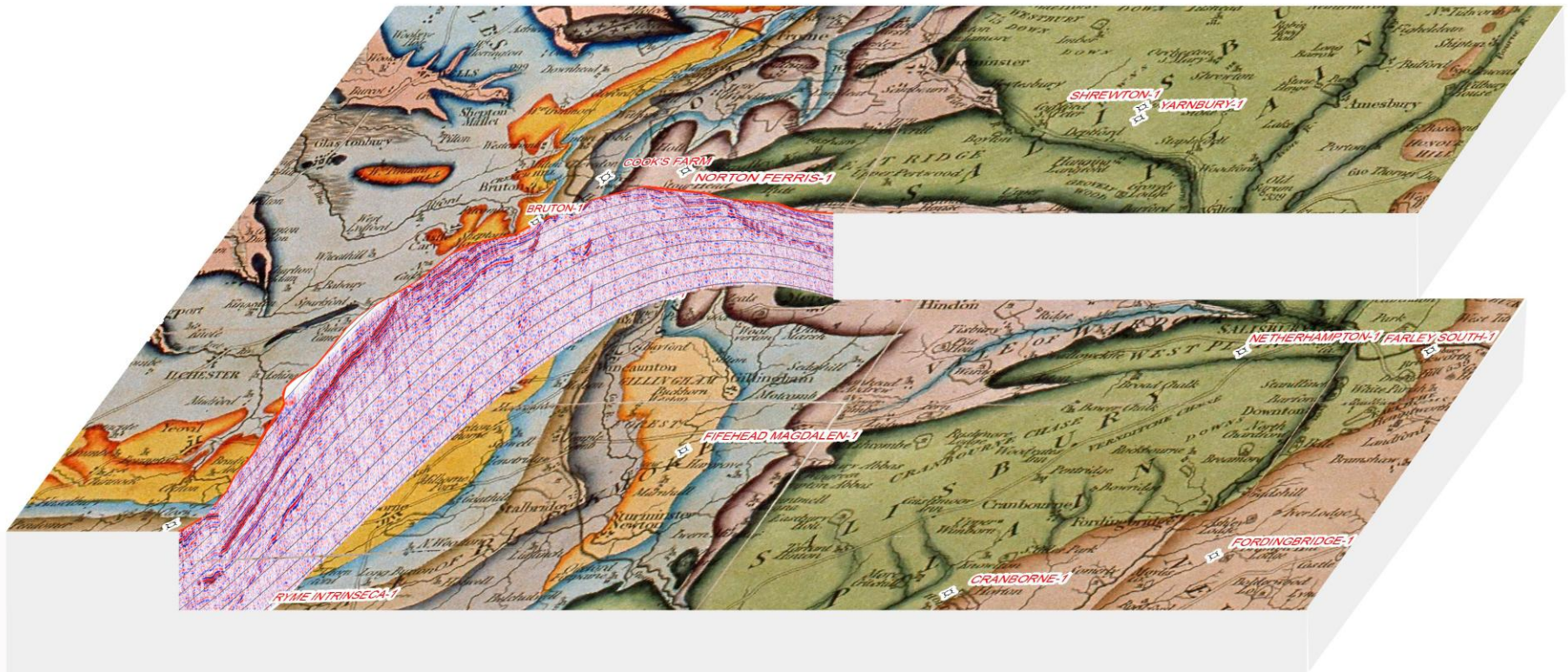
Figure 2. A part of William Smith's 1815 geological map in the southern England, with the seismic section CV80-082 projected along the line of section. Also shown is the location of the Cook's Farm trial, together with more recent wells and boreholes.