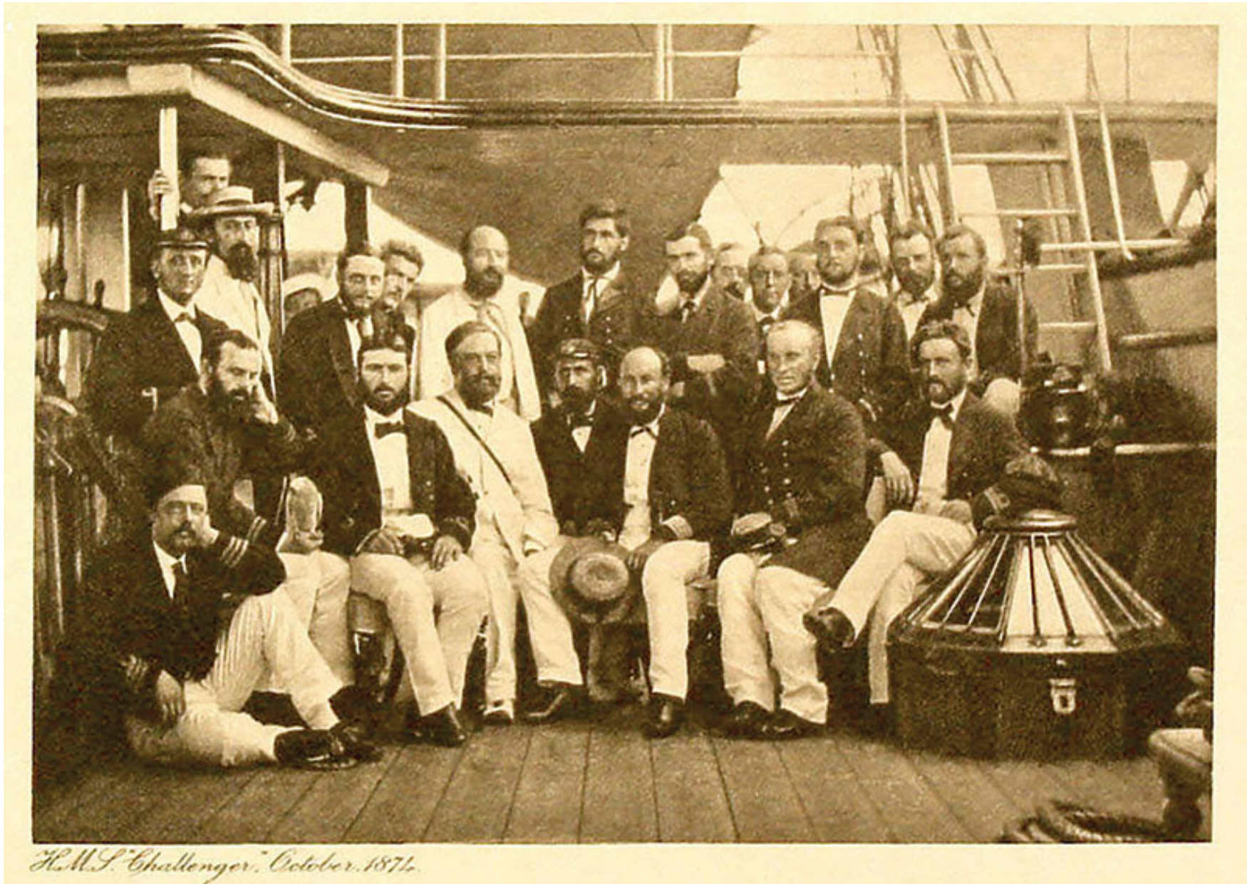
Figure 4. The science and ship crew of the HMS Challenger in 1874. The ship's complement included 21 officers and 216 crew members but was reduced to 144 by the end of the expedition due to deaths, desertions, crewmen being left ashore due to illness and planned departures.