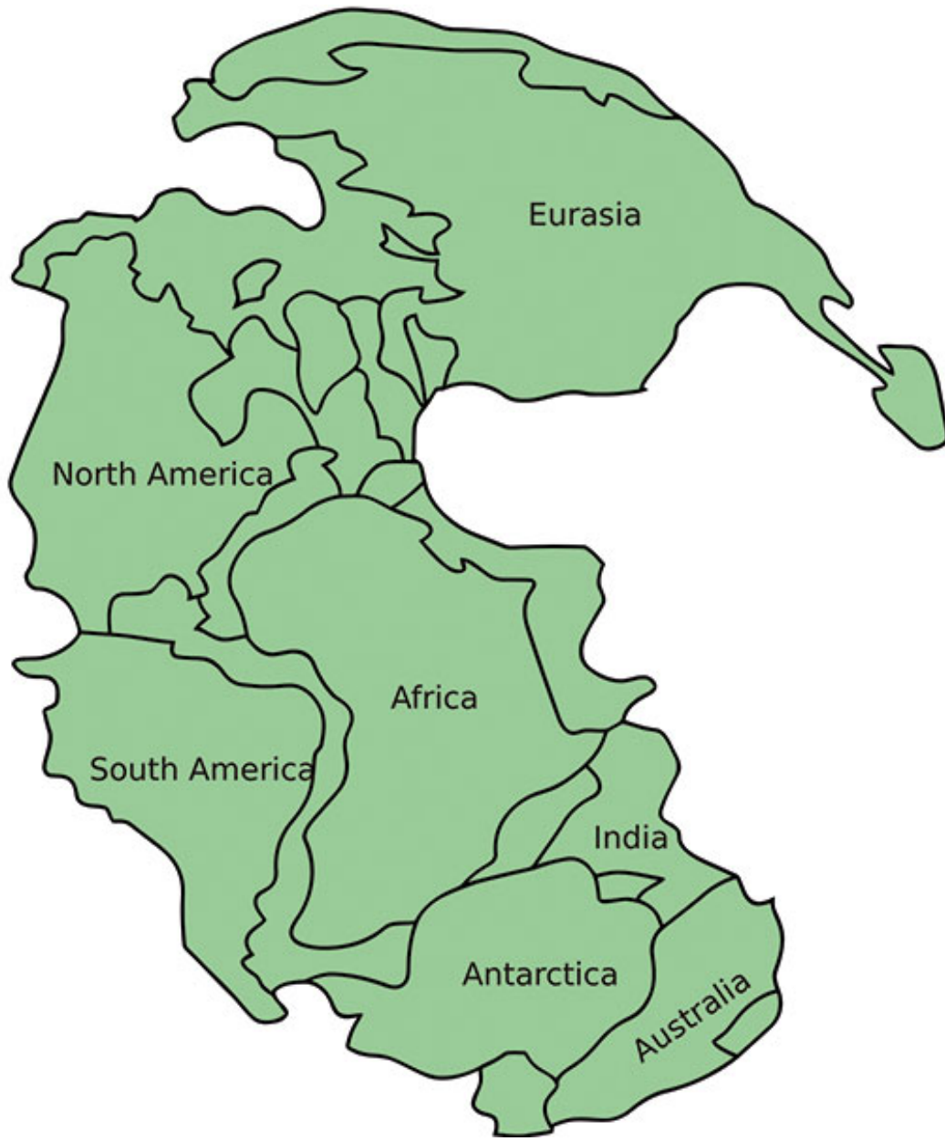
Figure 2. Pangaea, the supercontinent, began to break apart 175 million years ago. It was the last supercontinent that existed. This map shows the placement of continents in Pangaea.