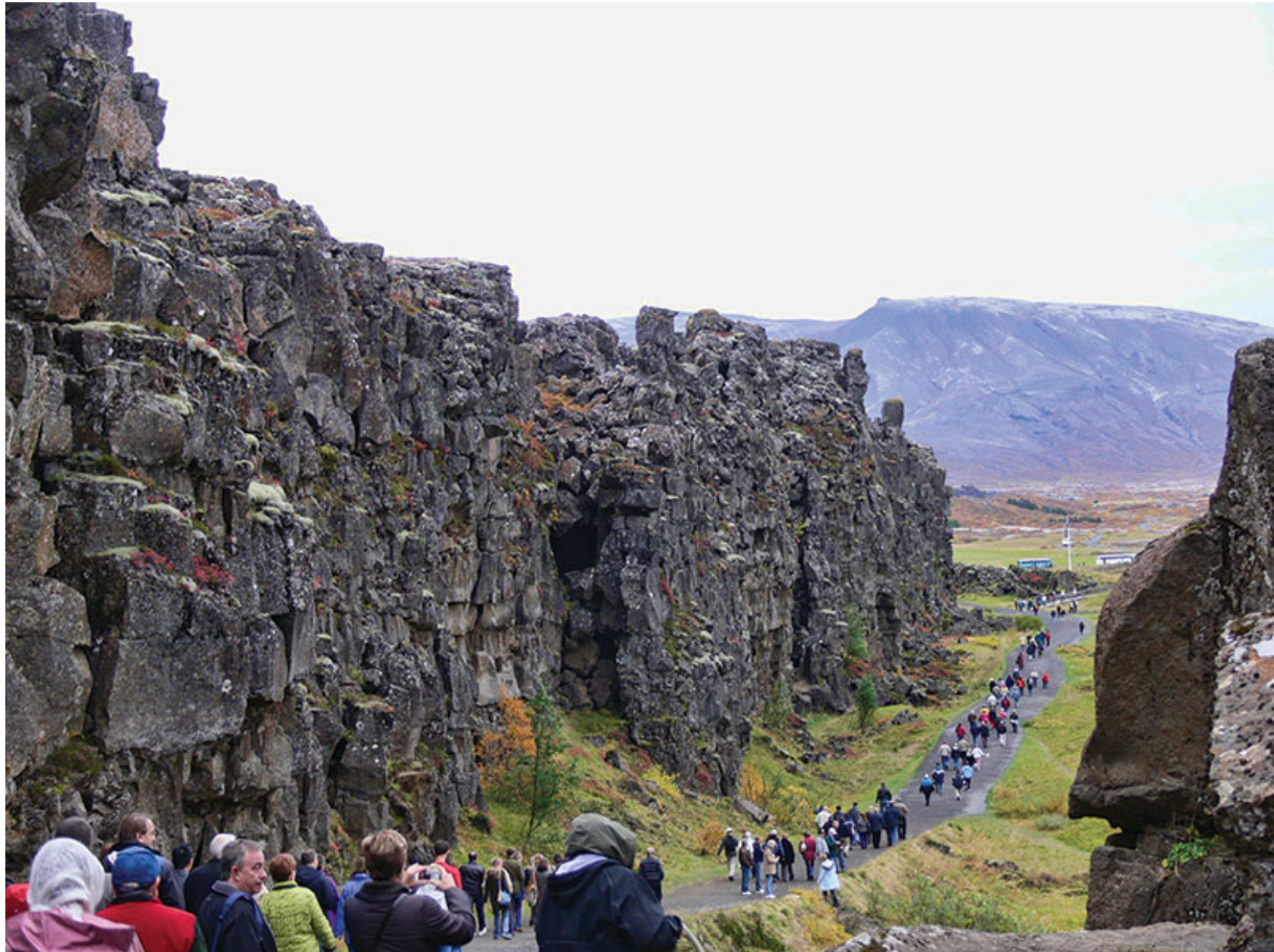
Figure 5. This rock outcrop in Iceland is a visible portion of the Mid-Atlantic Ridge and is the easternmost edge of the North American plate. Today, it is a popular destination for tourists in Iceland.