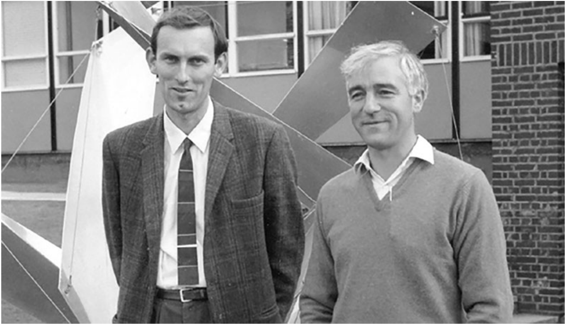
Figure 6. British geoscientists Frederick Vine (left) and Drummond Matthews. Matthews was Vine's doctoral supervisor at the University of Cambridge when they published their path-breaking contribution to the evolving concept of plate tectonics in 1963.