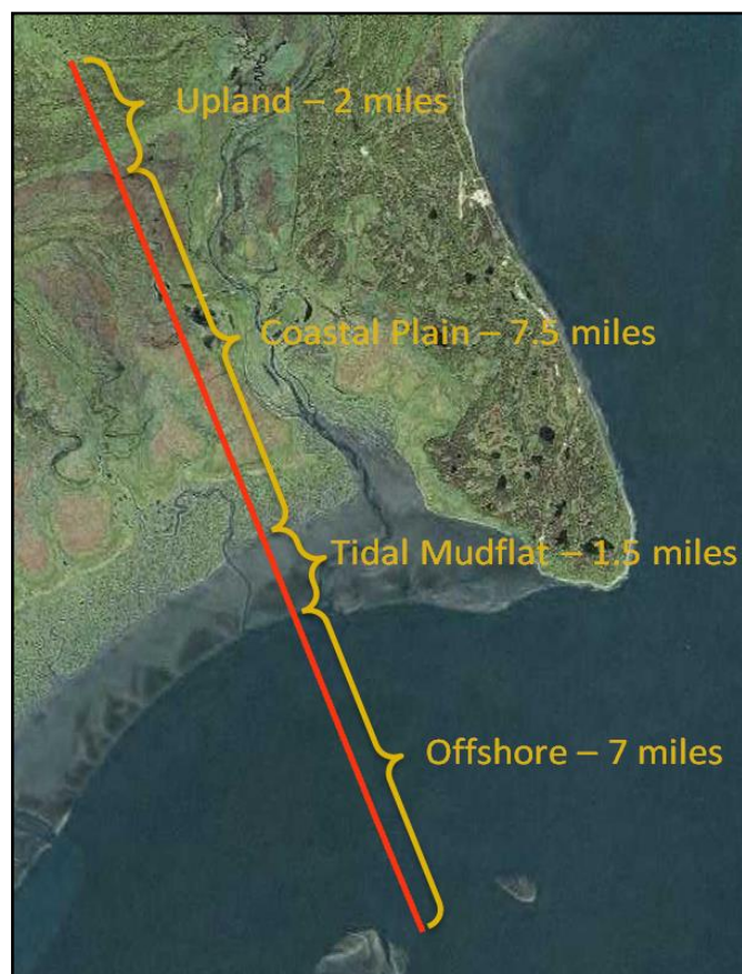
Figure 1 - Test Line Layout, West Foreland

To prove the viability of such a regional 3D program, and to evaluate equipment and parameters, a test program was carried out in early 2011. This test program, which proved successful, was followed by full-scale 3D seismic acquisition starting in the fall of 2011, continuing through the winter of 2011/12 and into the summer and fall of 2012.