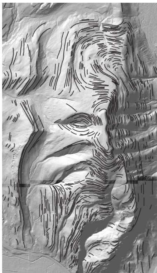
Figure 1: Traced lineaments over hill-shaded map. Scale 1:50,000.