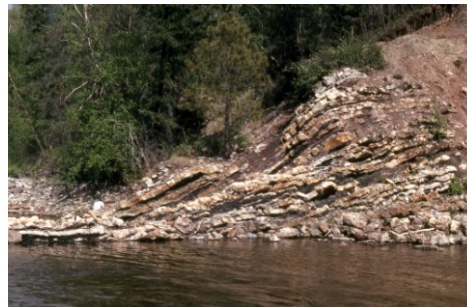
Figure 1. The Princeton Chert site in 1977.

Among the many fossil sites in the Princeton Basin, the most significant is the Princeton Chert on the right bank of the Similkameen River (Fig. 1) upstream from the town of Princeton (Stockey 2001). The site was first reported by Boneham (1968), with early scientific publications on the permineralized plants by Miller (1973) and Robison and Person (1973). Since then, many scientific publications have detailed the plants found and studied (Smith and Stockey 2007). The Princeton Chert site has yielded also a few vertebrate fossils, notably a soft-shelled turtle and a large fish in the bowfin family.