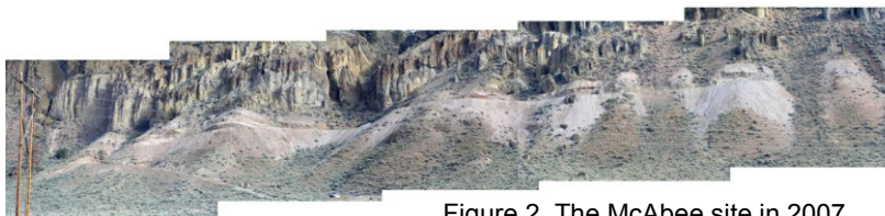
Figure 2. The McAbee site in 2007.

The McAbee beds are an informally named unit of lake-bottom sedimentary rocks