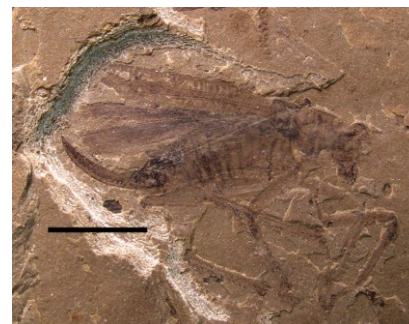
Figure 3. Fossil grasshopper at Thompson Rivers University; scale 1 cm.

rather common in the region, another example being the fossil beds near Falkland (Smith et al. 2009).