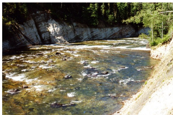
Figure 4. The Horsefly varve outcrop in the 1990s.

At the Horsefly Mine deposit of Eocene age on the banks of the Horsefly River (Fig. 4) the most abundant fossils are fishes (Fig. 5). The deposit also yields significant numbers of fossil insects (Fig. 6) and plants, many of them extremely well preserved, with remnant colour patterns (Fig. 7). Fossil flowers (Stockey and Manchester 1988), mosses (Janssens et al. 1979), and spiders (Selden and Penney 2009) from Horsefly have been the subject of scientific publications. However, the insects and plants from Horsefly