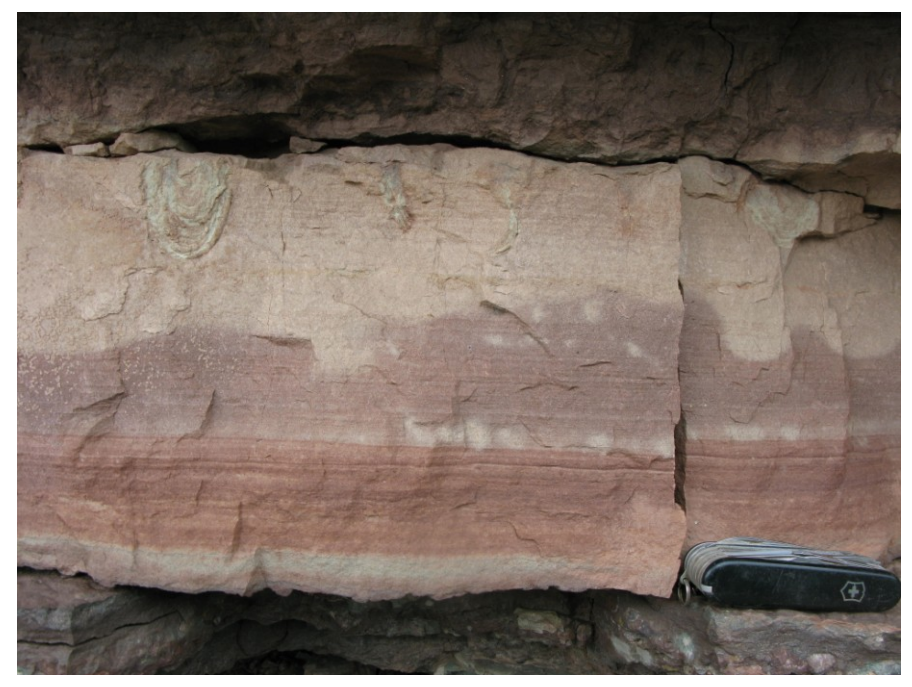
Figure 2: Weakly bioturbated sandstone with parallel lamination and Diplocraterion ichnofossil at upper left.