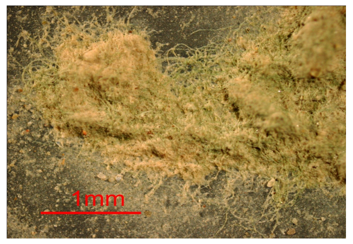
Figure 4: Matted growth form of Microcoleus growing on a sample of sediment from Racetrack Playa.

Figure 3: Elongate, narrow and segmented nature of Microcoleus , microscopic view.