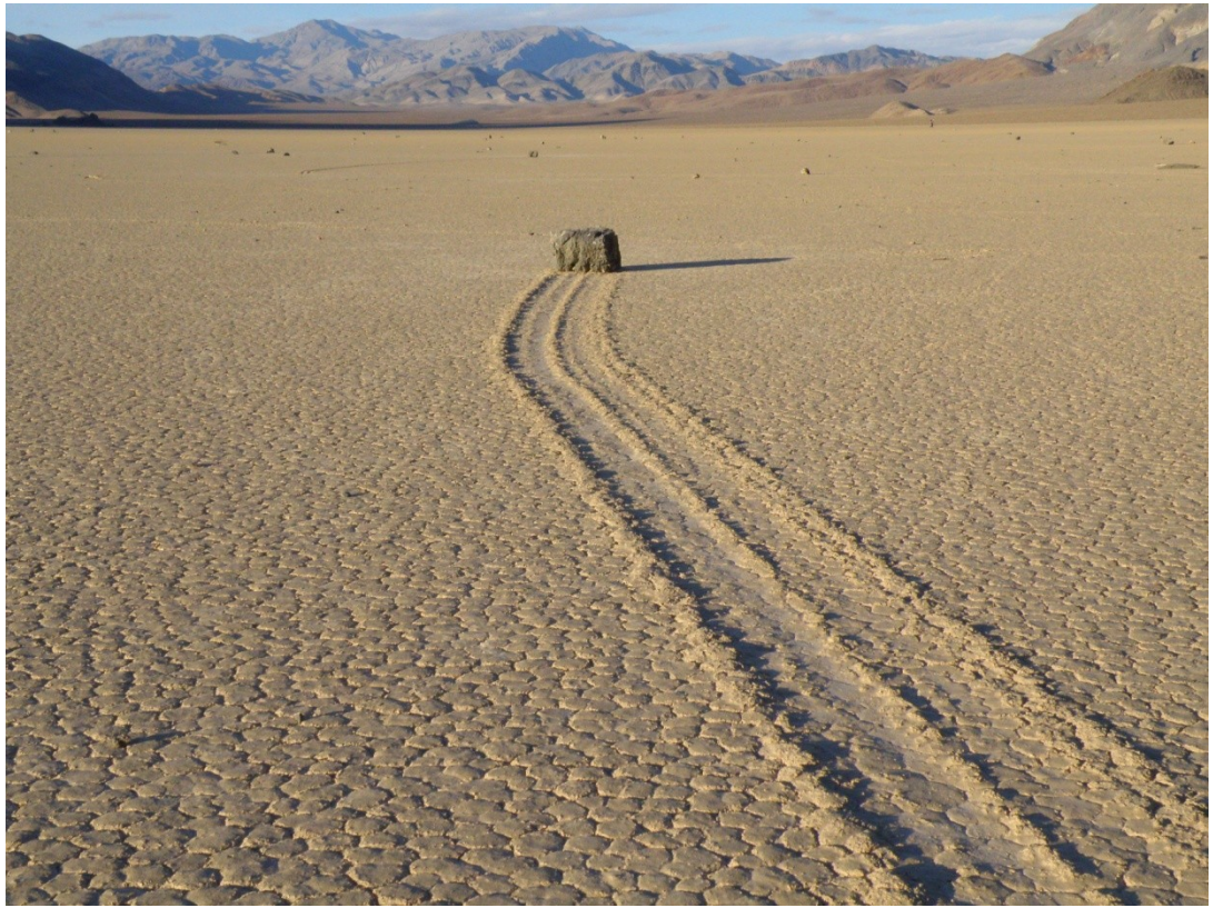
Figure 1: One of the many sliding rocks on Racetrack Playa, Death Valley National Park, in the winter of 2009. The rock is approximately 25cm across.