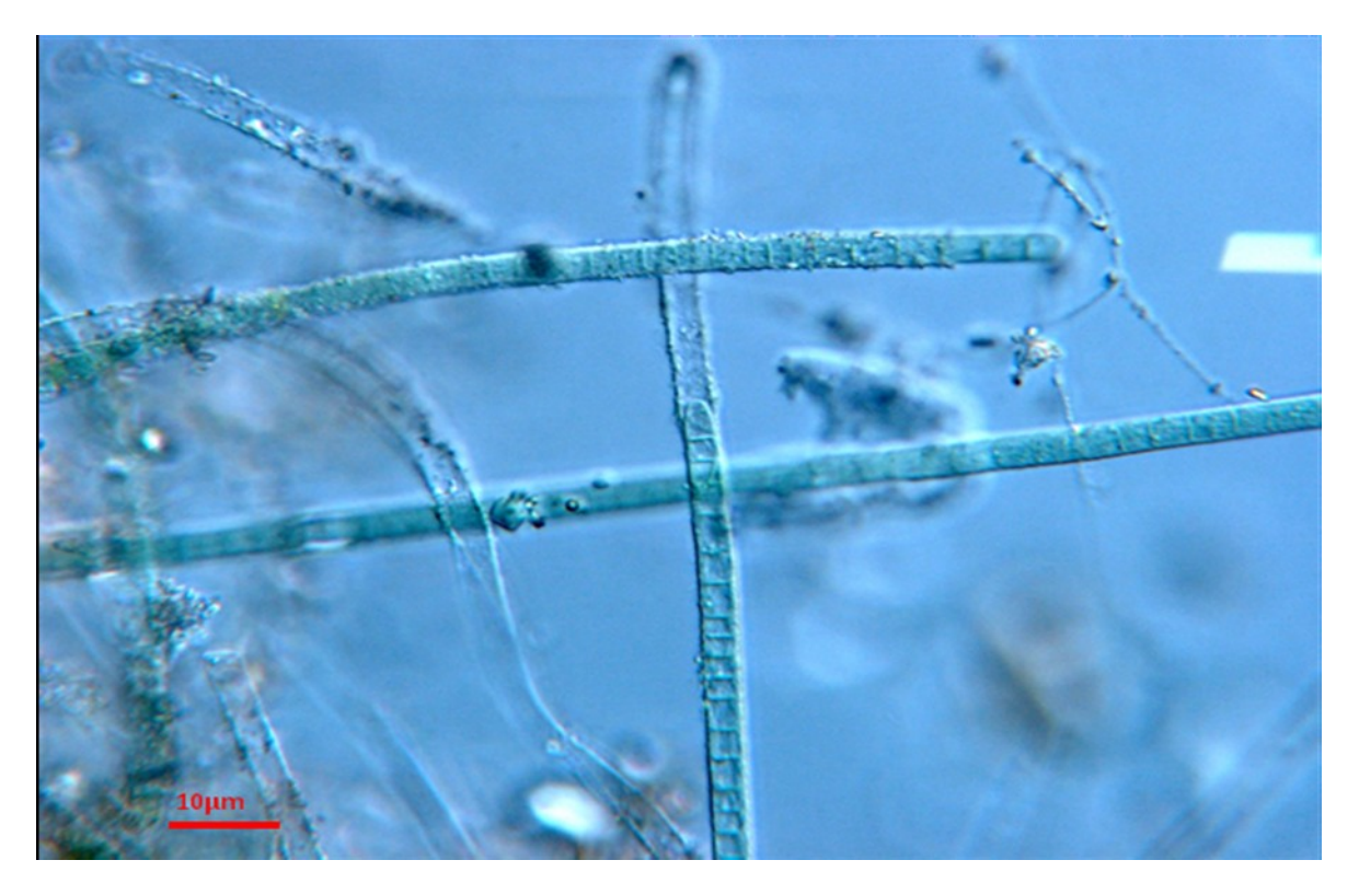
Figure 3: Elongate, narrow and segmented nature of Microcoleus , microscopic view.